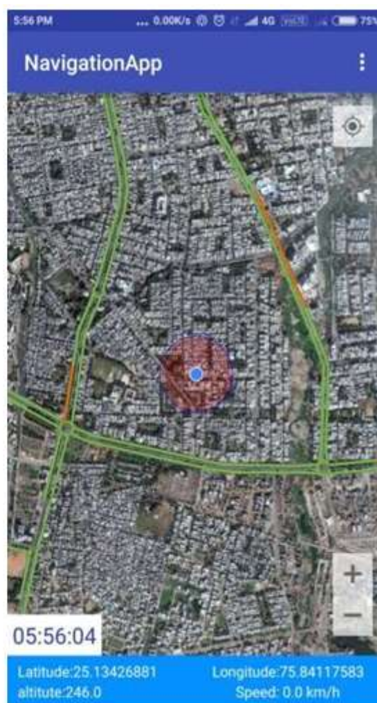
Figure 2 Map of Satellite View