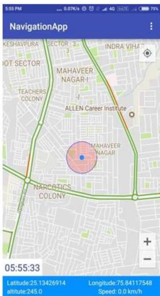
Figure 1 Map of Normal View

In this android based navigation application, the map is displayed in four different views: normal, hybrid, satellite and terrain view. Normal view shows roads, used lands and rail lines. Hybrid view is a combination of normal view and satellite view. Satellite view shows the pictures captured by satellite. Terrain view represents altitude.